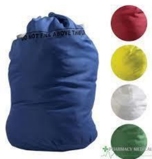
Coloured launderable linen bags for use with trollies