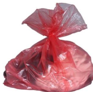
Red alginate dissolvable strip bag or fully dissolvable bag