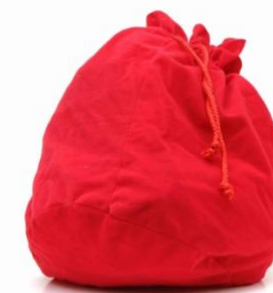
Red Linen Bag