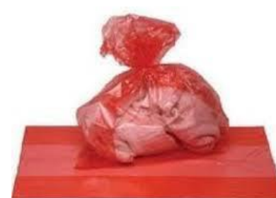
Red alginate water- soluble laundry bag