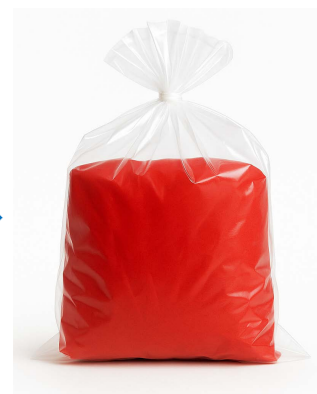
Non-permeable/ waterproof outer bag