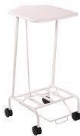
Foot pedal operated, lidded, single linen trolley