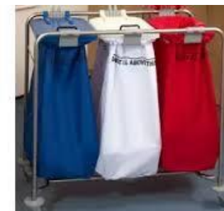
Triple, coloured, lidded linen trolley