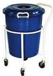
Removable lidded linen bin on wheels