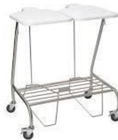
Foot pedal operated, lidded, double linen trolley