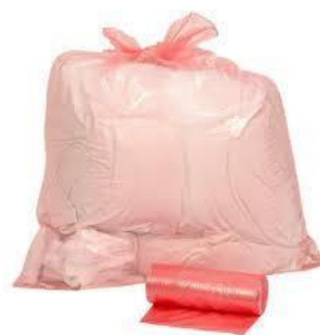
Red water-soluble strip sack for infectious linen