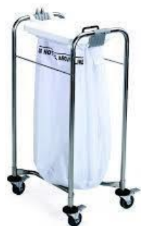
Single wheeled, lidded trolley