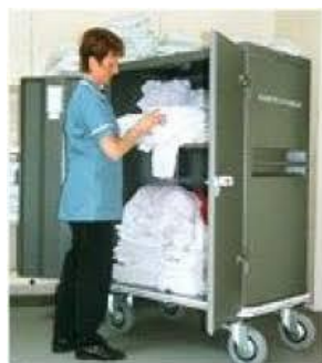
Alternative trolley for storage of clean linen