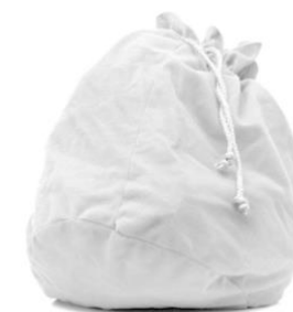
White Linen Bag