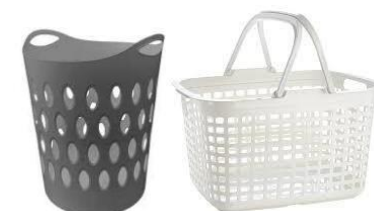
Portable linen baskets (where lift may not be available)