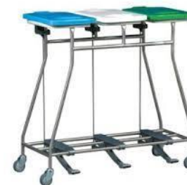
Foot pedal operated, coloured, lidded, triple linen trolley